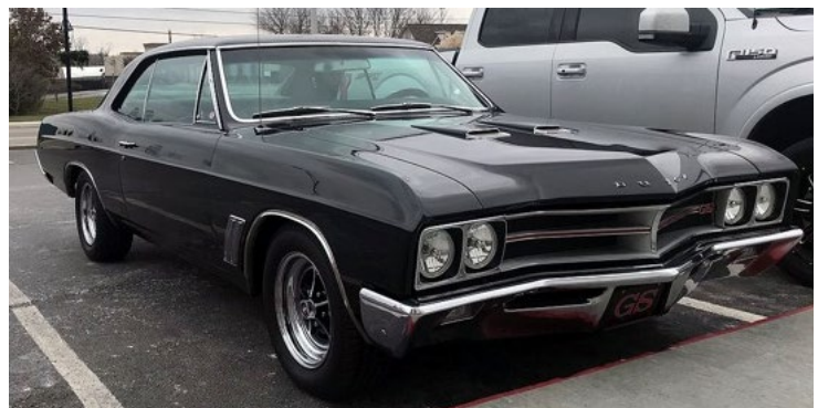
JW and Laura's 1967 Buick GS 400. (Because car guys' brains are wired differently people are often remembered by the cars they owned.)